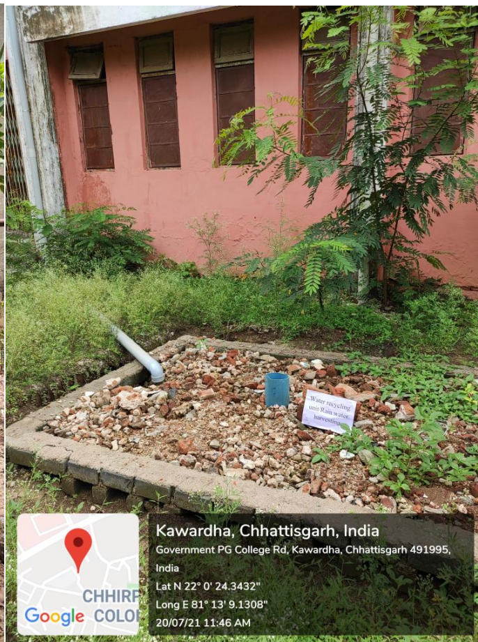
PLATE- Showing Rain Water Harvesting unit-1 and unit-2 Criteria 7.1.4