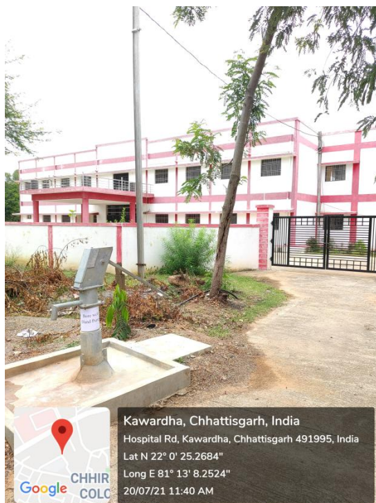
PLATE- Showing Bore wells Unit-1: Electrical Pump Unit and Unit-2 Hand Pump Unit.